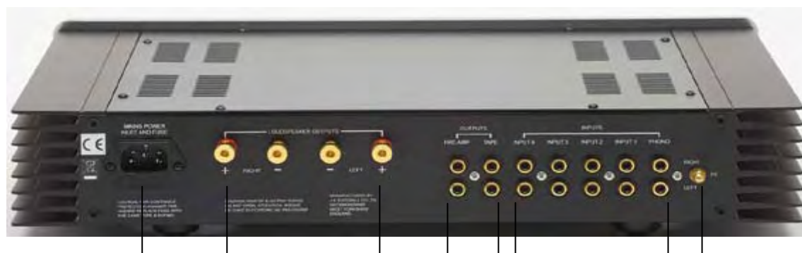
MAINS INPUT LOUDSPEAKER OUTPUT SIGNAL OUTPUTS SIGNAL INPUTS EARTH